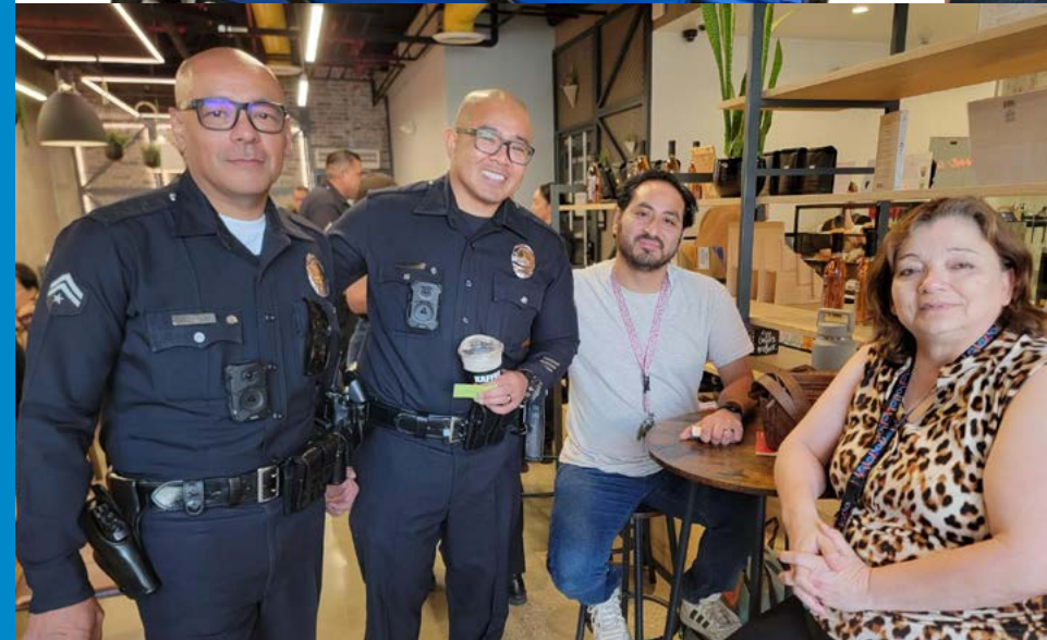
In a continued effort to strengthen community ties, a Los Angeles Council District 10 and LAPD Senior Officer both met with residents at Berendo Sage in Los Angeles. Our residents had a chance to ask questions and received helpful answers and additional resources from the team.